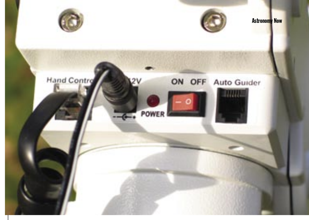
The EQ6 and HEQ5 mounts are compatible with the ST4 autoguider.

When viewing Mars using the Evostar 100mm OTA, the images were as good as you could hope for in this price range and considerably better than I have seen with some larger Newtonian reflectors. Saturn was lovely with the subtle banding and the Cassini division seen extensively. The Moon looked good with no apparent false colour and some of the smaller craters in Clavius resolved well. Perhaps the larger focal ratio helped. The cooling time of the 100mm tube seemed comparable with that of the 80mm and, whilst bigger, it was